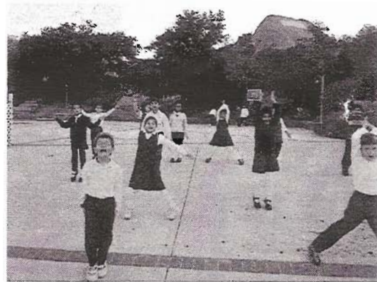
Future Olympians train during morning P.E.

The U.S. also had a winner in gymnastics. His name was Paul Hamm. For the men's 100meter final in running our winner was Justin Gatlin. This year U.S.A. won 103 medals. We wish to win many more medals in the next Olympics, which will take place in Beijing, China in the year 2008.